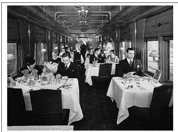
Northern Pacific Dining Car