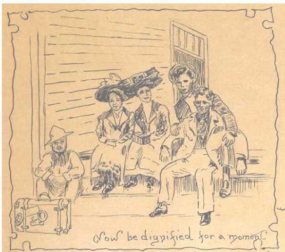
Below, L-R: "Now be Dignified a Moment", "The Dainty Belle of the Flower Ball", and "Jenny", 1910.